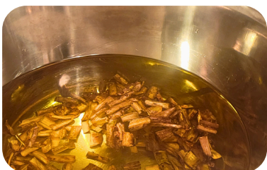
Devils club salve process