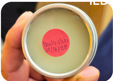
Devils club salve