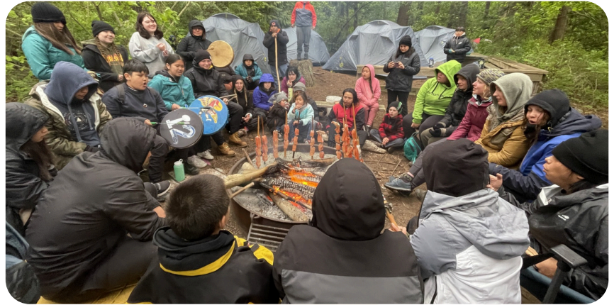
The WŚÁNEĆ Leadership Secondary School, Whiteswan Environmental, Whatcom Intergenerational High School, and Western Washington University students at WTÁEMEN, 2023