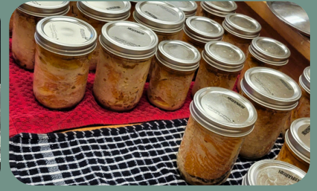
Jarring Fish with Esquimalt High School