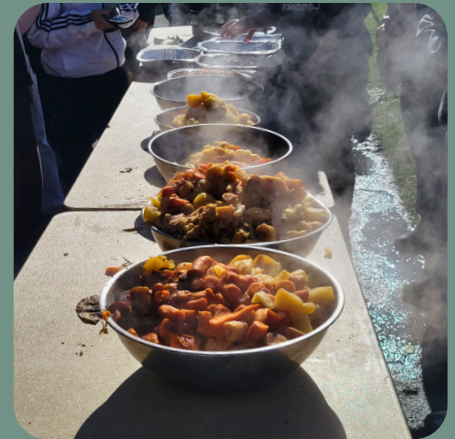
Fire roasted fish during a pitcook at Lambrick school