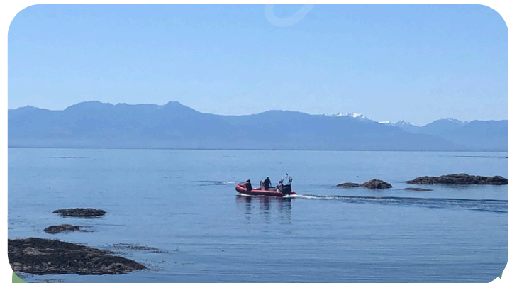
BOTTOM: Youth on the water, exploring the vibrant waters of Tl'ches (Discovery Island Marine Park)

The summer camps involved 23 youth in fishing, creative arts, island exploration, traditional food preparation, and activities focused on climate action, archaeology, and local history. The program concluded with an end-of-summer feast attended by 80 family members.