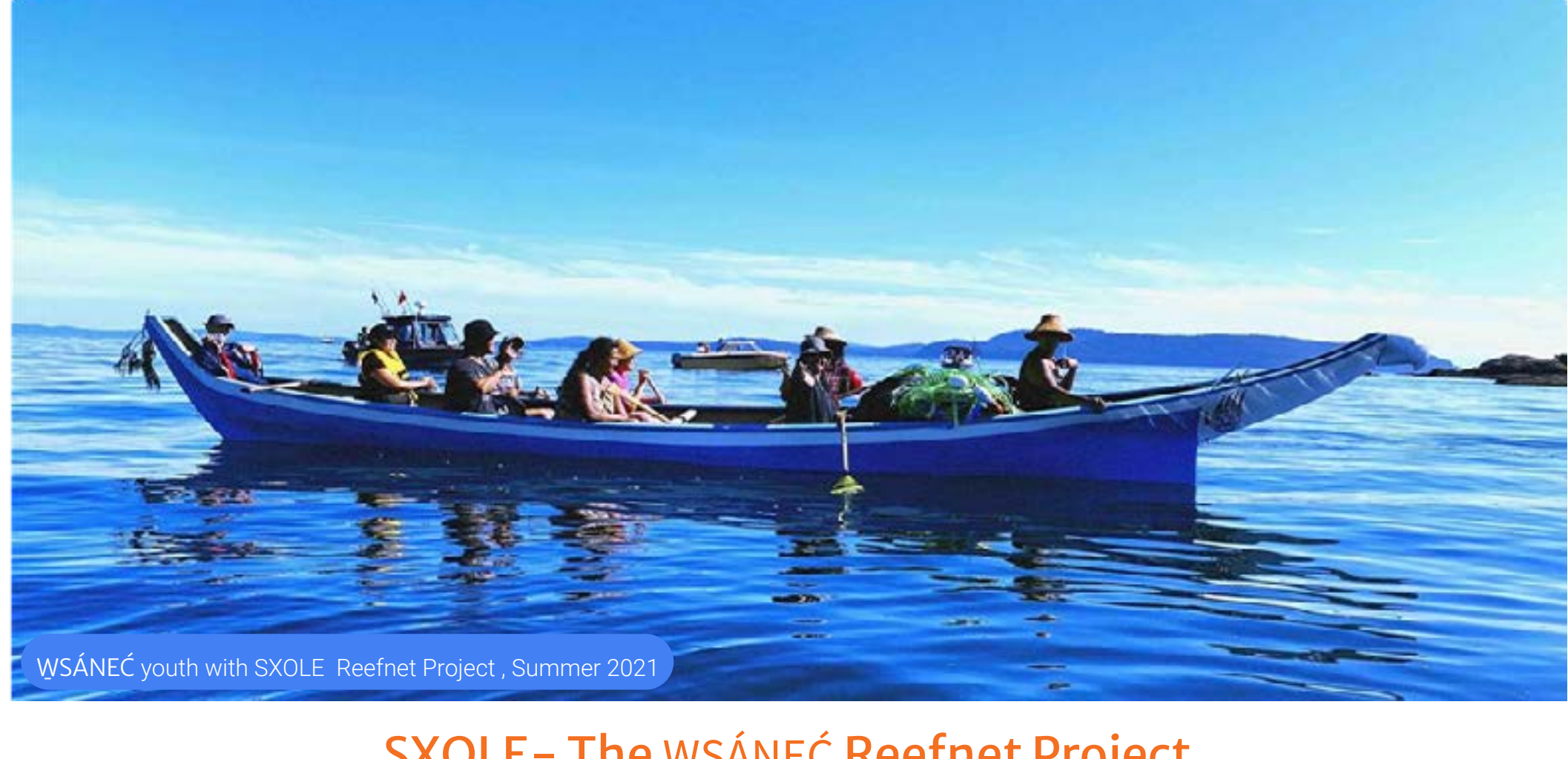
WSÁNEĆ youth with SXOLE Reefnet Project - Summer 2021