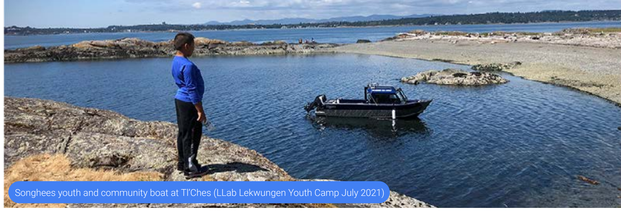
Songhees youth and community boat at Tl'Ches (LLab Lekwungen Youth Camp July 2021)