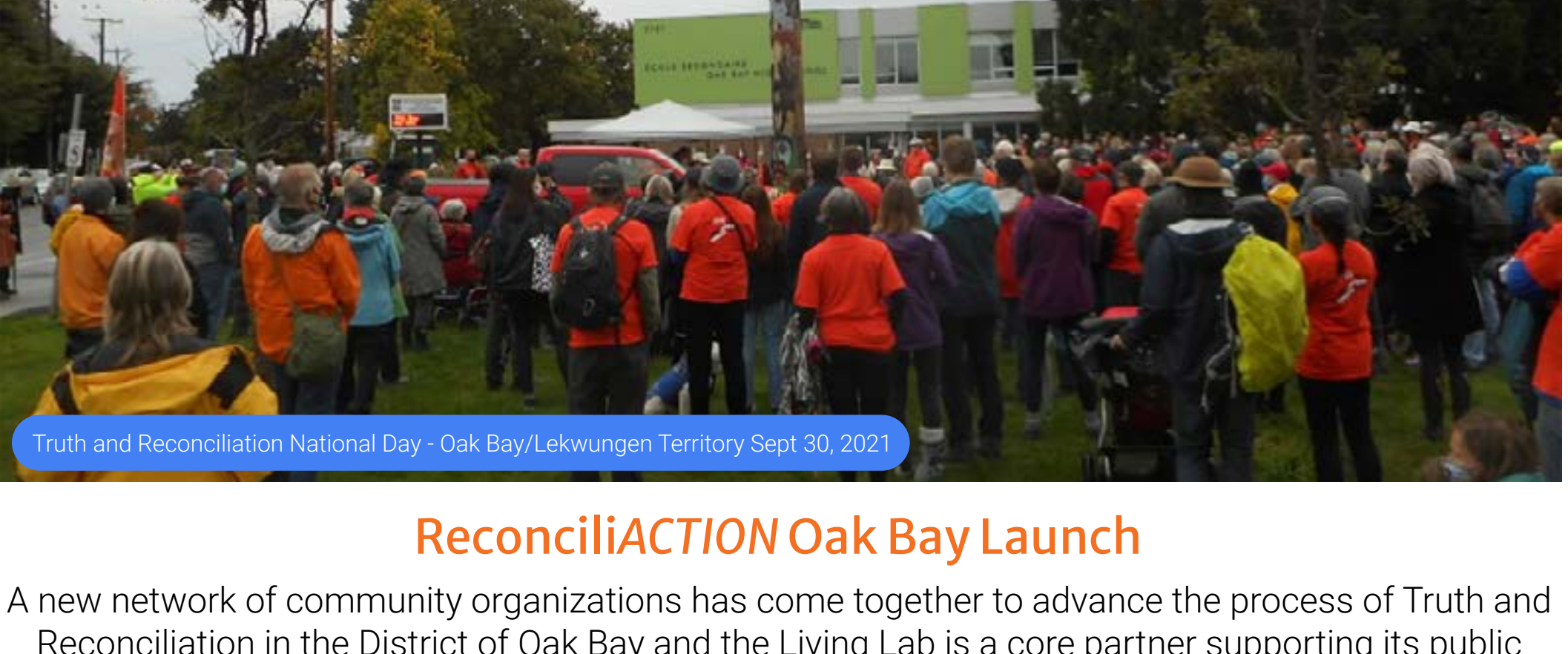
Truth and Reconciliation National Day - Oak Bay/Lekwungen Territory Sept 30, 2021